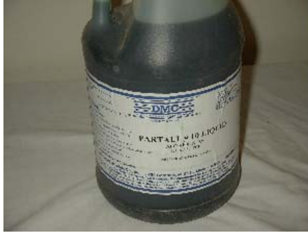
PVA Mold Release