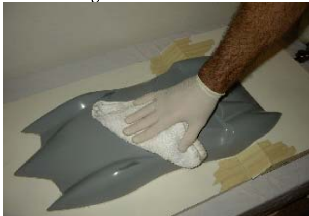
Figure 10: Wax Off

Wax Off: Buff the plug to a smooth, glossy finish.