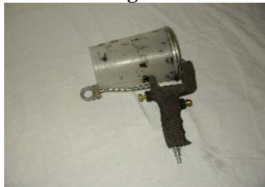
Dump Gun: For Gelcoat