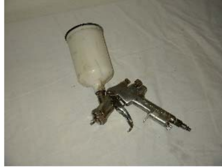
Typical Spray Gun

If the PVA is applied with a spray gun, apply 4 or 5 mist coats at 50 PSI. If the PVA is applied with a cloth, saturate the cloth and wipe the PVA onto the plug with one pass. The PVA will dry in approximately 30 - 60 minutes (depending on the ambient temperature) and is then ready for the first layer of tooling gelcoat.