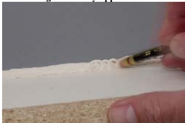
Figure 6: Clay application 2

To ensure proper filling, use an eraser head to push the clay deeper into the gaps.