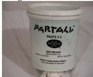
Figure 8: Release Wax

Release Wax: Partall manufactured by Rexco has always given me excellent results.