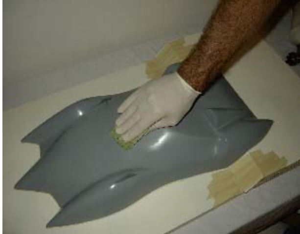
Figure 9: Wax On

Wax On: At least five coats. Notice that I covered some imperfections in the base board with masking tape. It is OK to do this. Just make sure to wax over the tape and apply PVA to it just like the rest of your project.