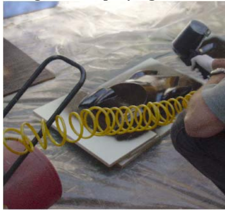
Figure 15: Spraying Gelcoat

Spray the gelcoat at a distance of 6 to 12 inches. Make sure to apply the gelcoat evenly. Make sure to spread a drop cloth. Gelcoat is very adhesive and messy. You don't want gelcoat on something that you don't want gelcoat on.